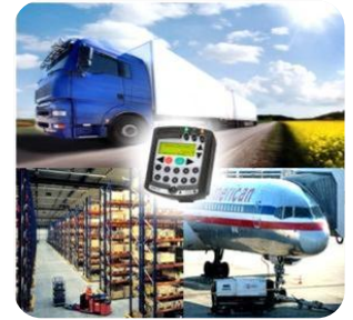
Market Penetration U.S. Supply Chain (1.5M Units)